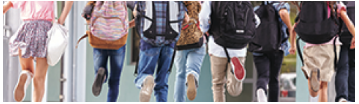
Looking for a private school in Boston? Let us help.