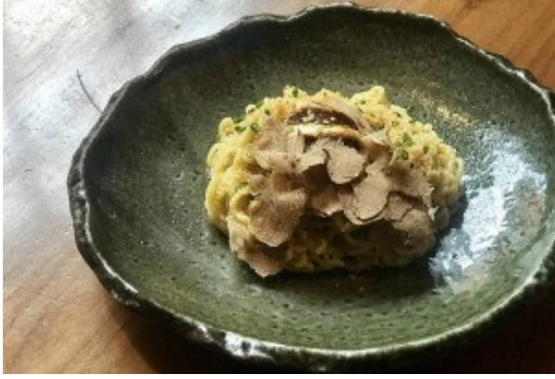
Where to Indulge in White Truffles around Boston