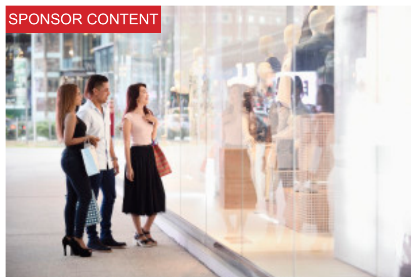
Take This Quiz and Discover Your Shopping Savviness by Rakuten