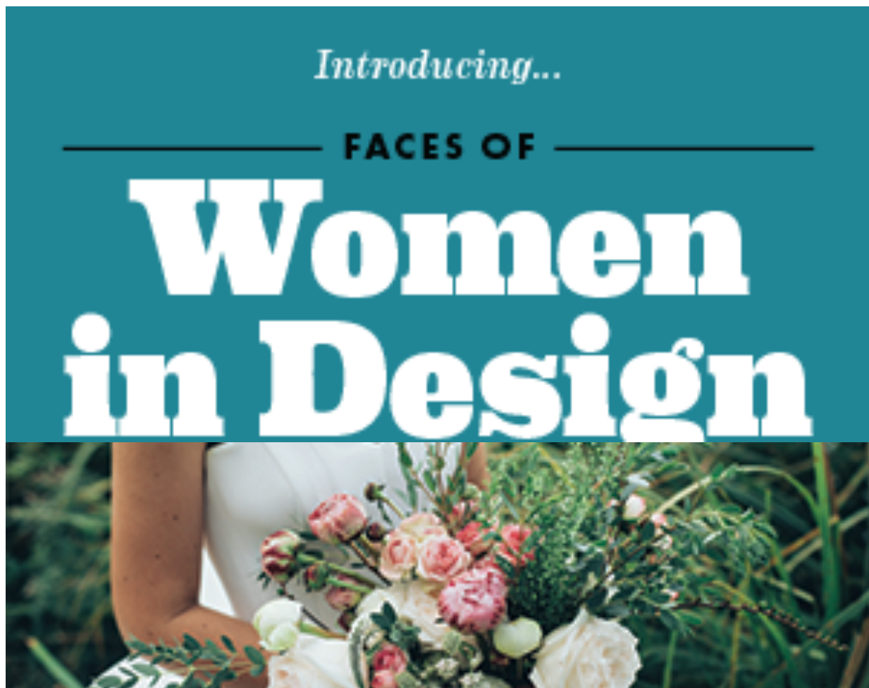
Getting married? Start and end your wedding planning journey with Boston Weddings' guide to the best wedding vendors in the city.